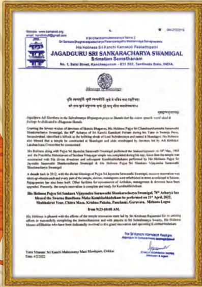
Srimukham from Srimatam