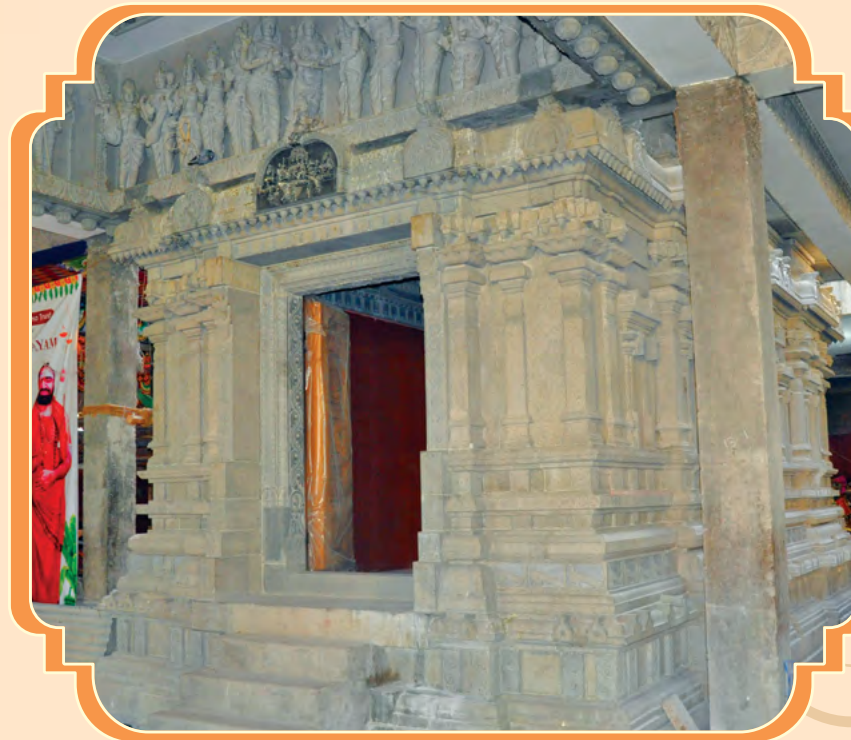
Sri Subrahmanya Swamy - Garbhalayam