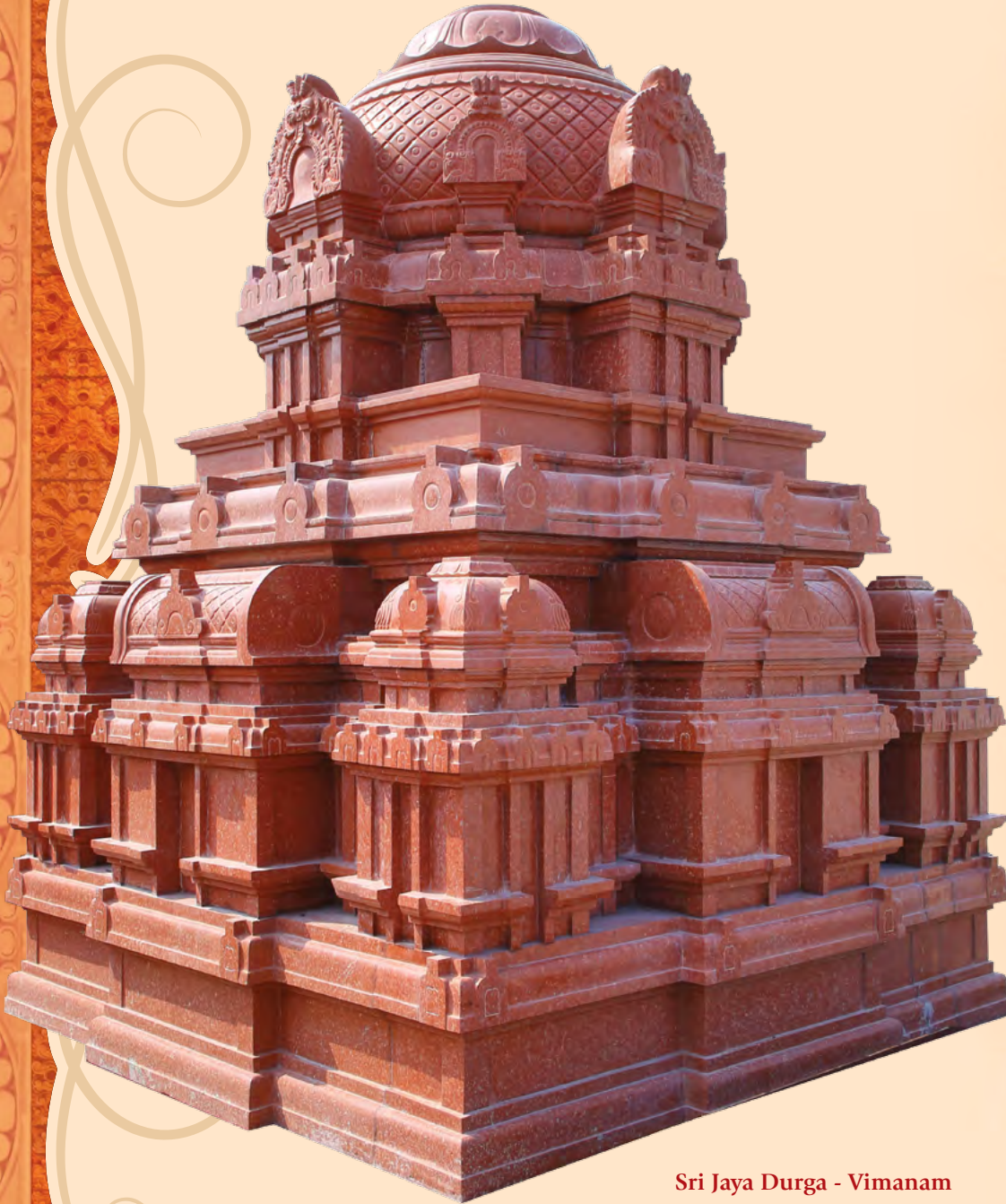
Sri Jaya Durga - Vimanam