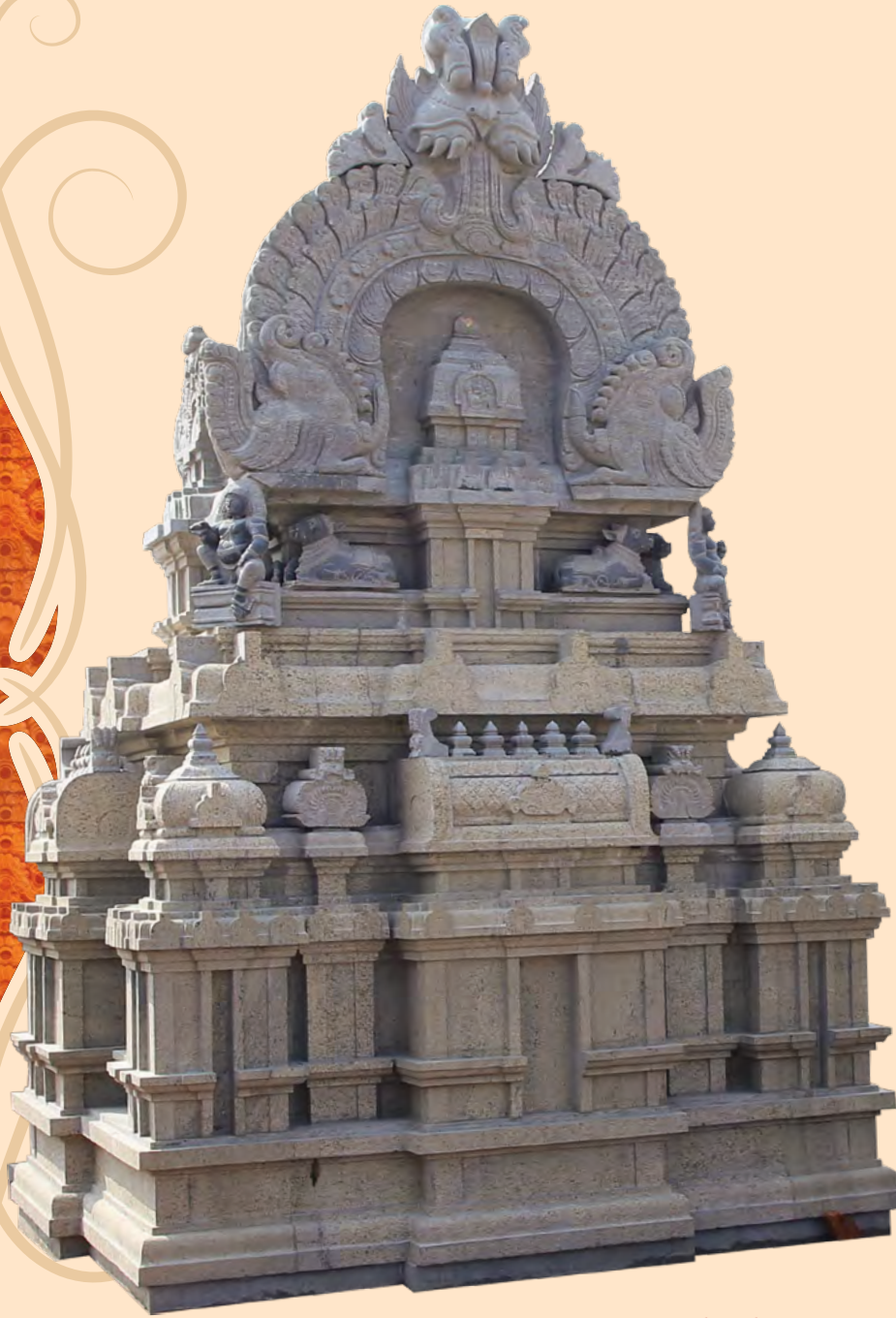
Sri Ekambareswarar - Vimanam