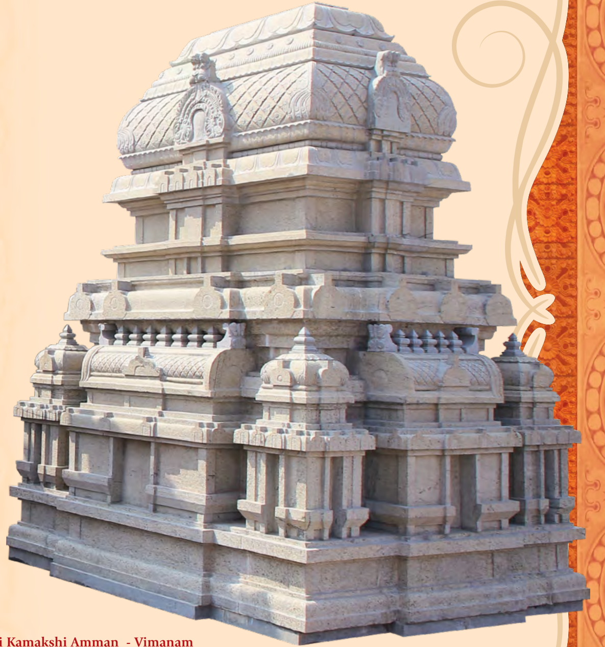
Sri Kamakshi Amman - Vimanam