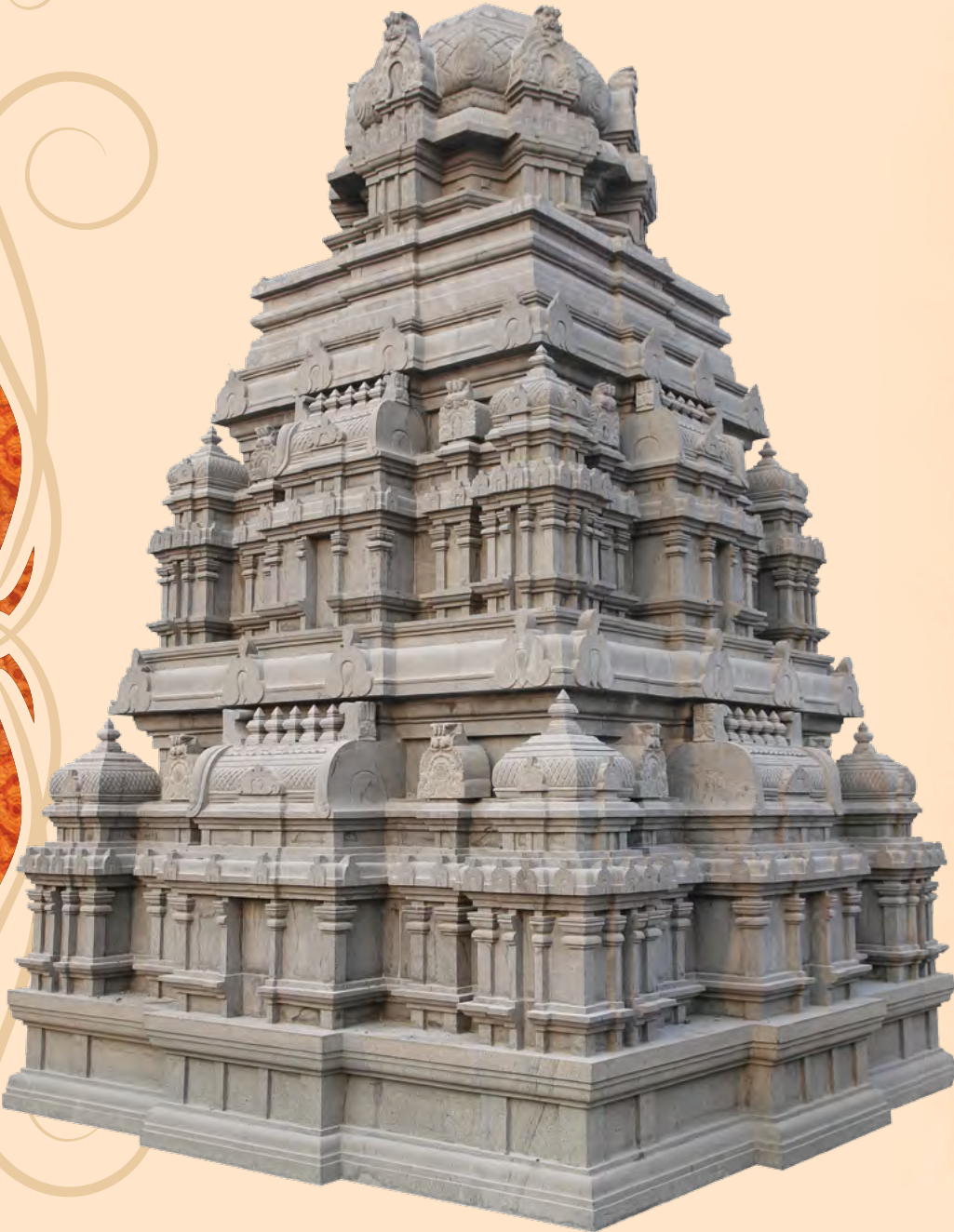
Sri Subrahmanya Swamy - Vimanam