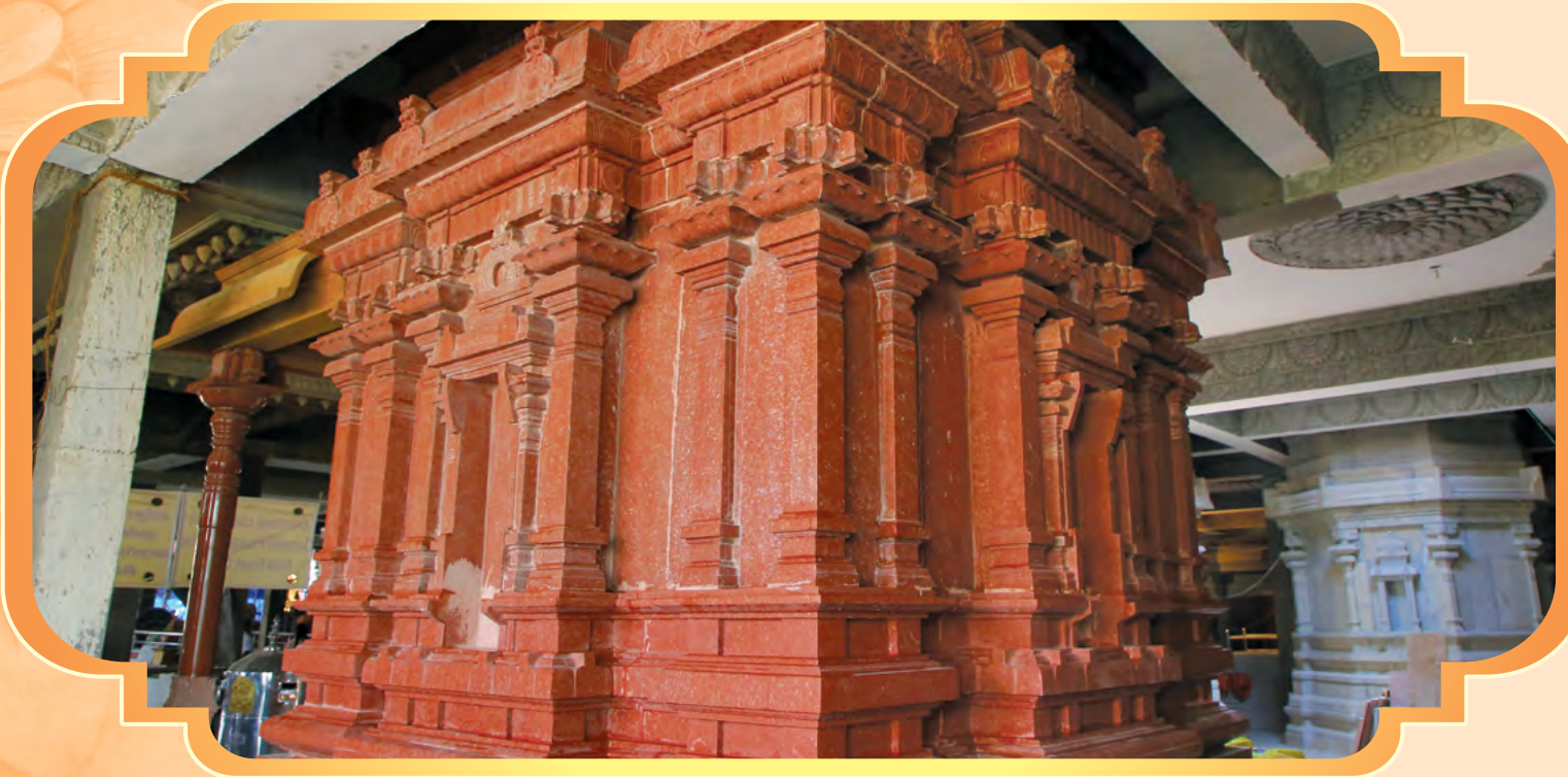
Sri Jaya Durga - Garbhalayam