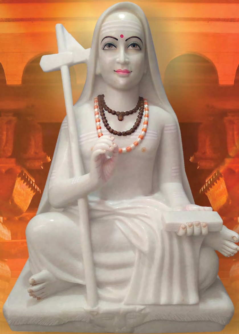
Sri Adi Sankara - Skandagiri Jaya Jaya Sankara - Hara Hara Sankara