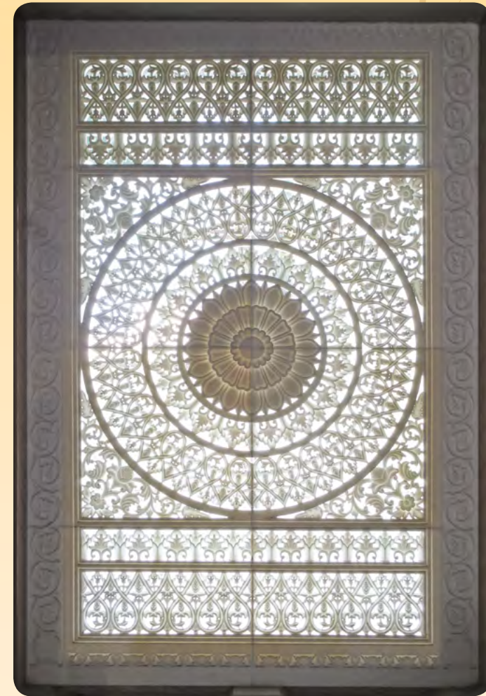
Ornamental Vietnam marble jalli - East of Rajagopuram