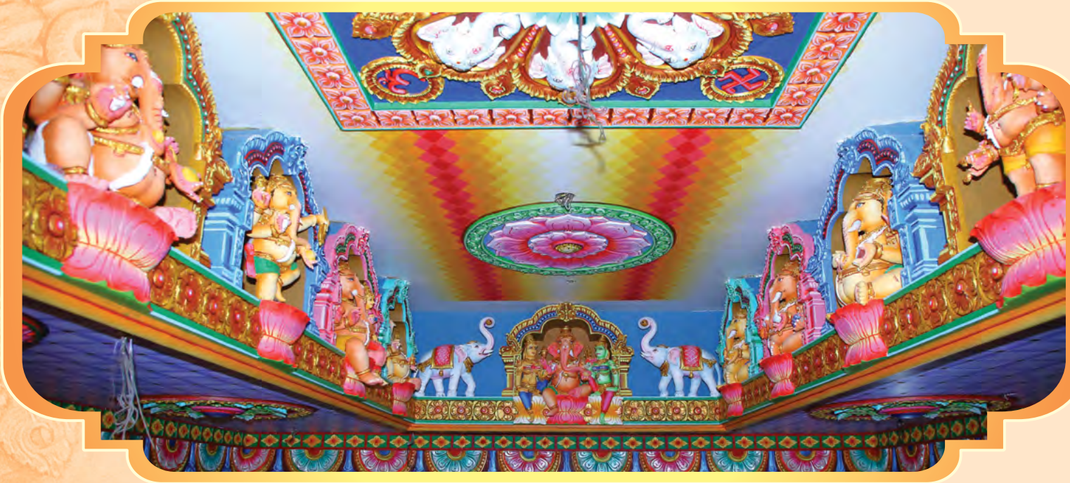
Ceiling in front of Sri Vinayagar Garbhalayam