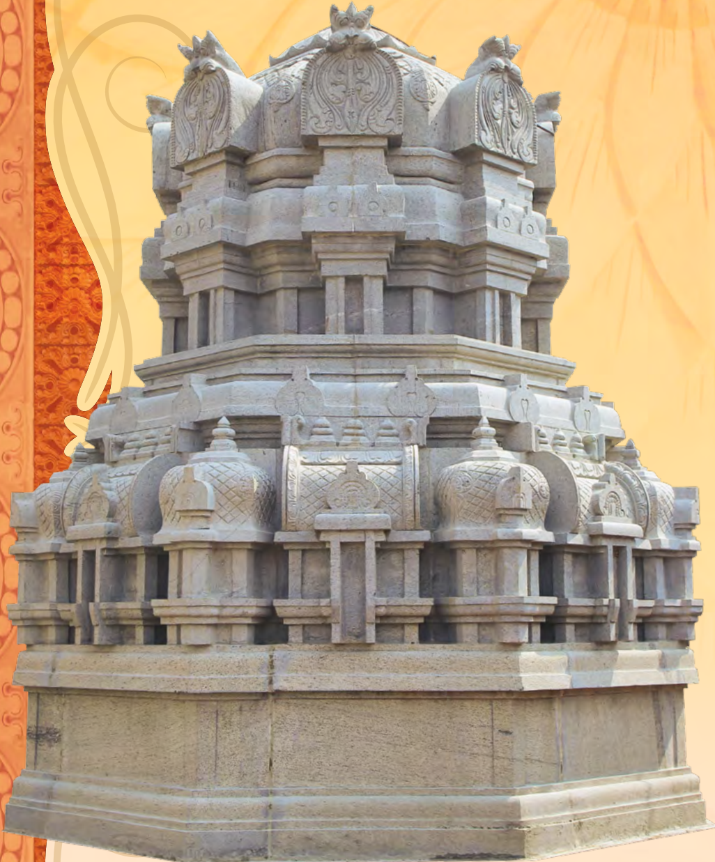
Sri Varadarajar Swamy - Vimanam

Skandagiri Sri Subramanyaswamy Sanathana Dharma Trust (Regd.) (Under the aegis of Sri Kanchi Kamakoti Peetam, Kanchipuram, Tamilnadu) Sole Trustees of