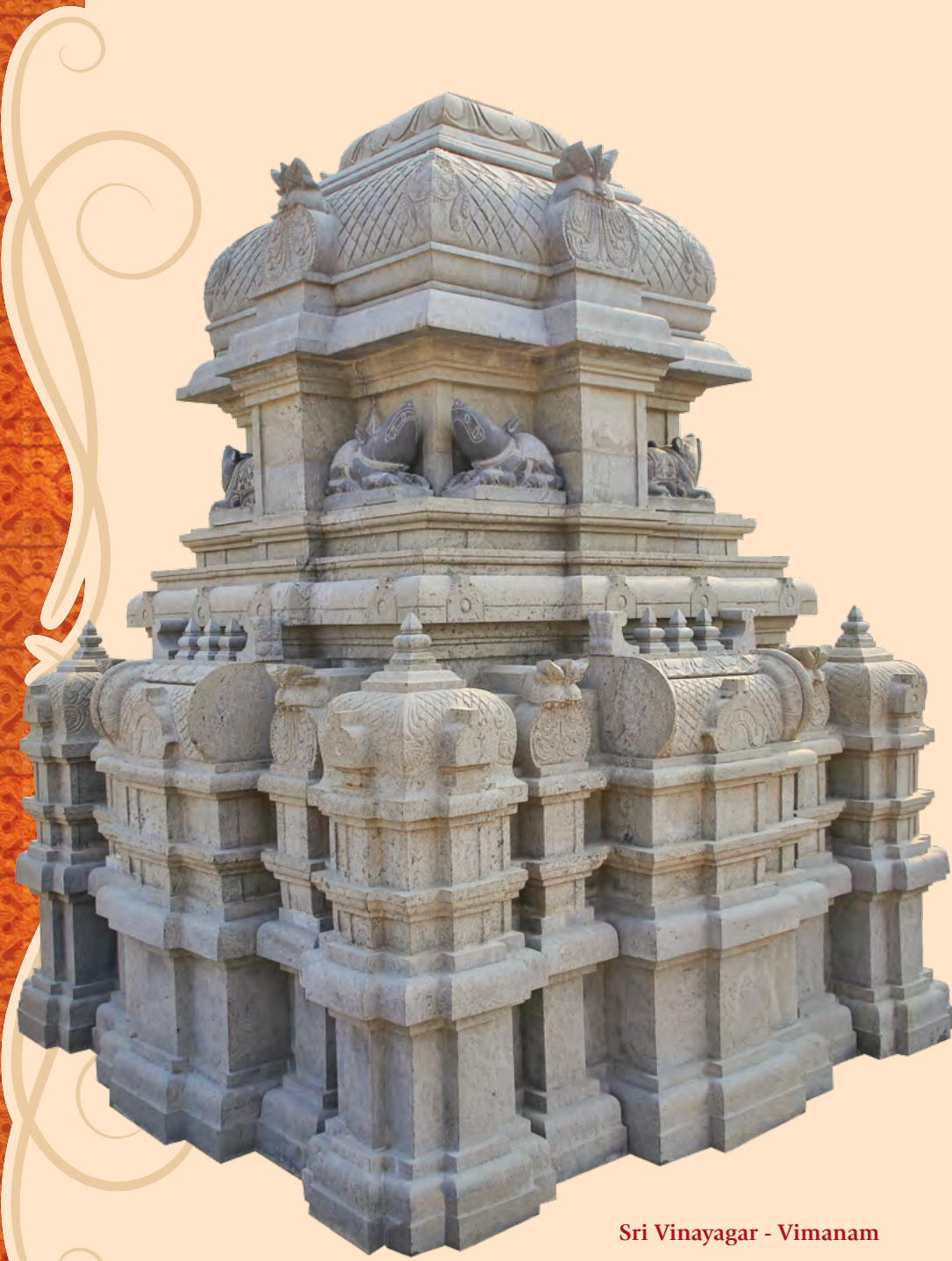
Sri Vinayagar - Vimanam